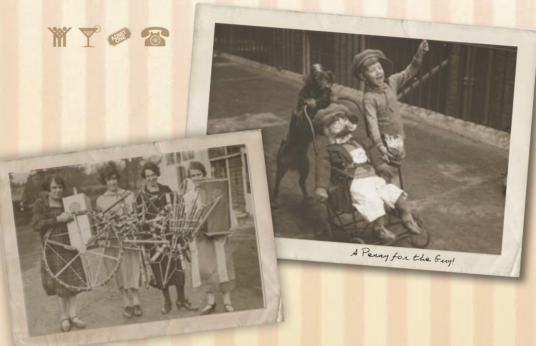
A Penny for the Guy!