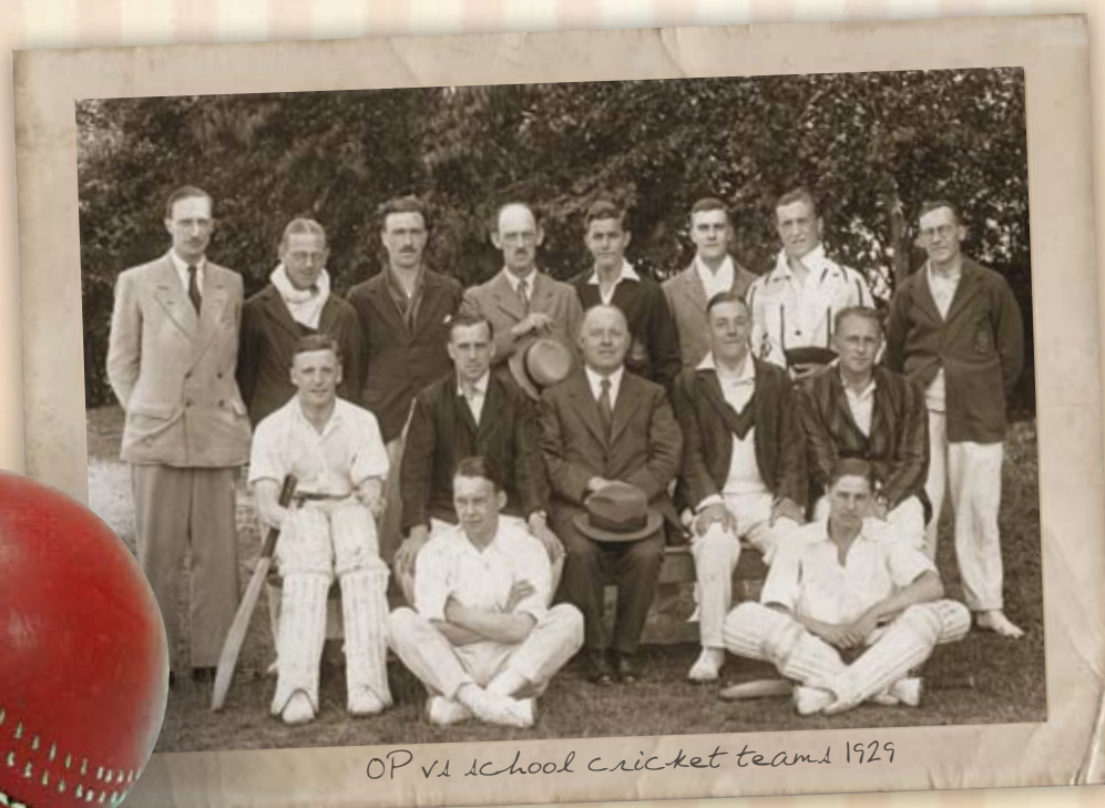
OP vs school cricket teams 1929