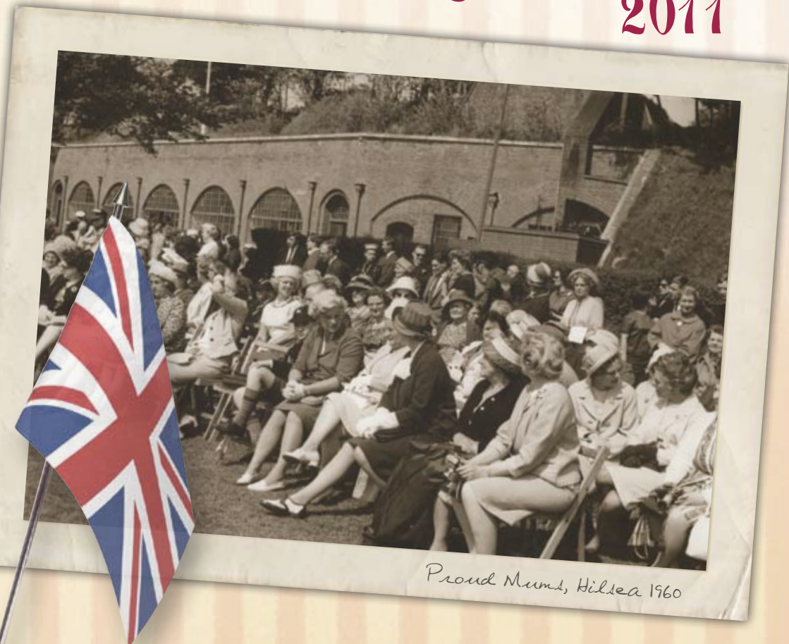
Proud Mums, Hilsa 1960