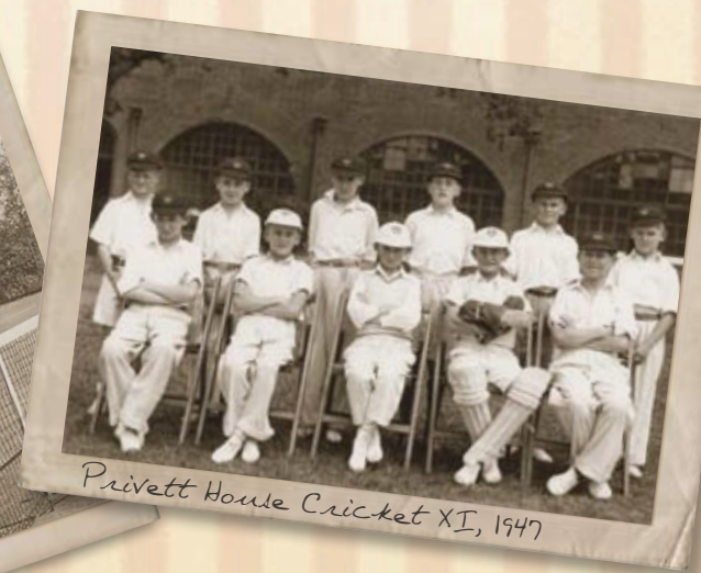
Privett House Cricket XI, 1947