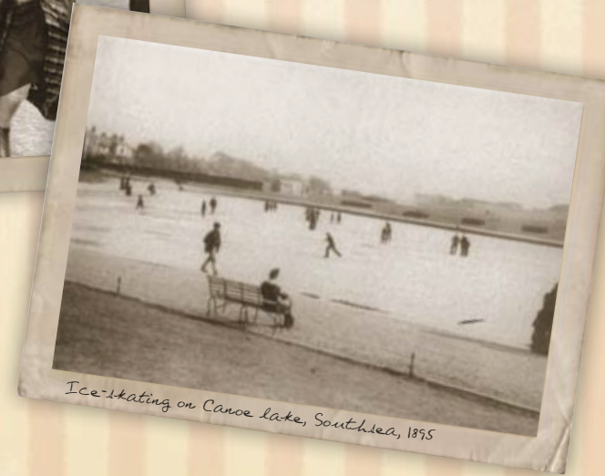
Ice-skating on Canoe Lake, Southsea, 1895